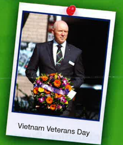
Vietnam Veterans Day