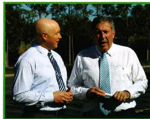
Bryan & Hon Duncan Gay, Minister for Road & Ports